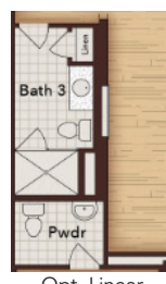
Opt. Linear Fireplace