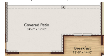
Opt. Sliding Glass Door