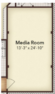
Opt. Media Room ILO 3rd Car Garage