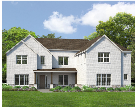
ELEVATION B MEDIA W/ STONE