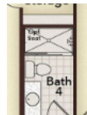
Opt. Walk-In Shower @ Bath 4