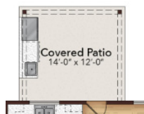
Opt. Outdoor Kitchen