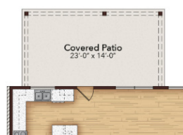
Extended Covered Patio