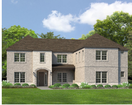
ELEVATION A MEDIA W/ STONE