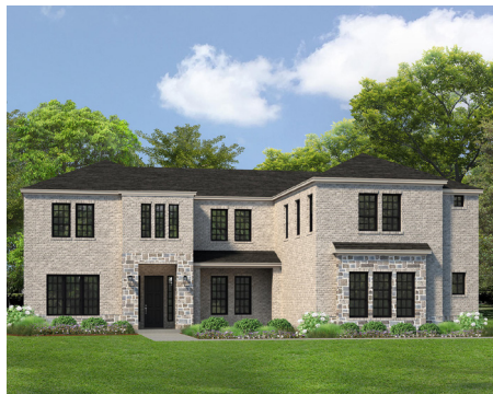
ELEVATION C MEDIA W/ STONE