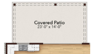
Extended Covered Patio with Sliding Glass Door