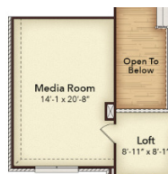
Opt. Media Room