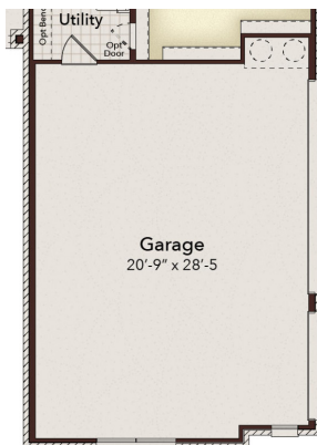
Opt. 3rd Car Garage