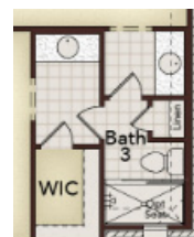
Opt. Walk-In Shower @ Bath 3