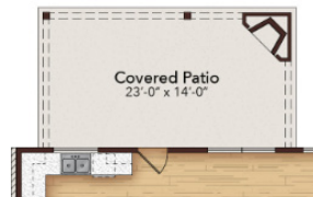
Extended Covered Patio with Fireplace