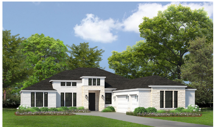
ELEVATION C STONE 3-CAR GARAGE

*These renderings are an artist's interpretation, actual colors and selections may vary. Some elements shown in renderings display optional upgrades.