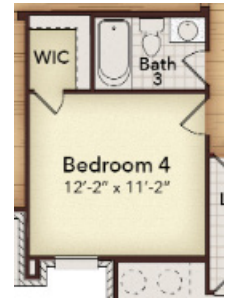
Opt. Bedroom 4 & Bath 3