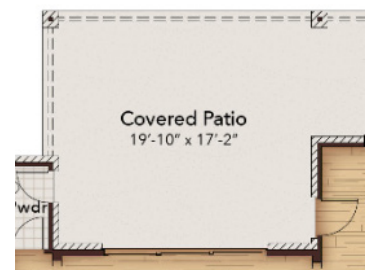
Opt. Sliding Glass Door