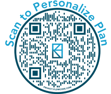
Interactive Floor Plan & Exteriors