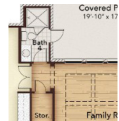
Opt. Bath 4 ILO Powder Bath