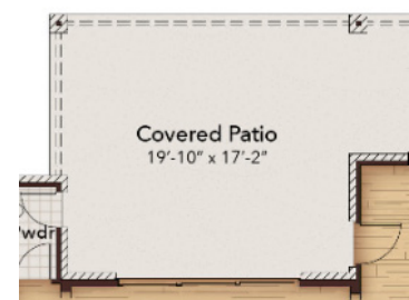
Opt. Sliding Glass Door