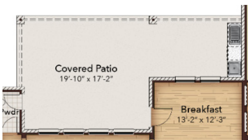
Opt. Outdoor Grilling Station