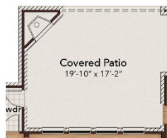
Opt. Outdoor Fireplace