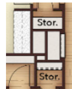
Opt. Electric Fireplace