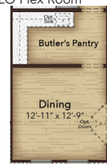
Opt. Dining Room w/ Butler's Pantry