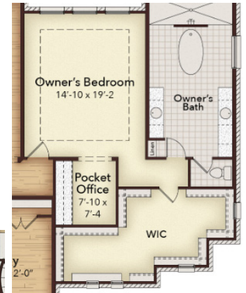
Opt. Pocket Office