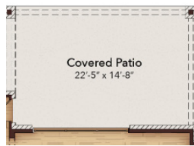
Opt. Sliding Glass Door