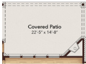
Opt. Outdoor Fireplace