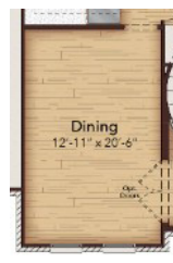
Opt. Dining Room ILO Flex Room