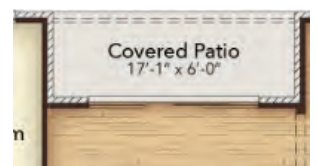
Opt. 12' Glass Door System