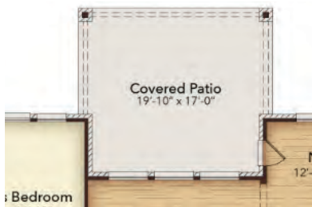
Opt. Covered Patio Extension 2