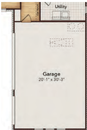
Opt. 3rd Car Garage