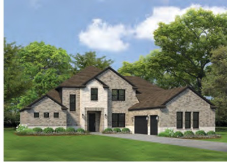
ELEVATION A 3-CAR GARAGE