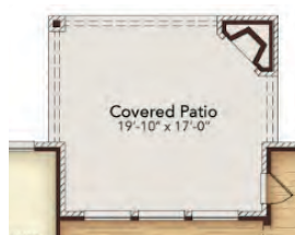
Opt. Covered Patio Extension 2 With Fireplace