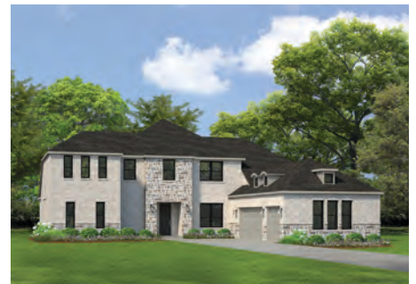
ELEVATION C MEDIA & 3-CAR GARAGE

*These renderings are an artist's interpretation, actual colors and selections may vary. Some elements shown in renderings display optional upgrades.