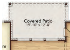
Opt. Covered Patio Extension 1