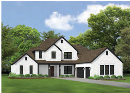
ELEVATION B 3-CAR GARAGE