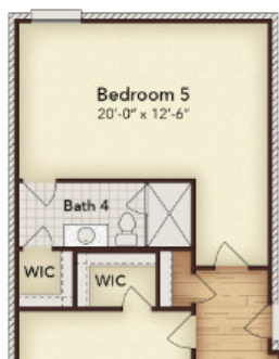
Opt. Bedroom 5/ Bath 4 ILO Flex Room