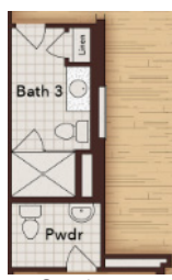
Opt. Linear Fireplace