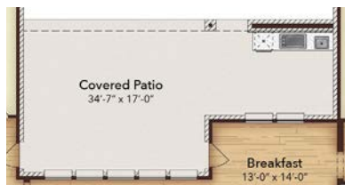
Opt. Outdoor Kitchen