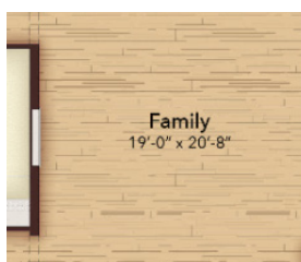
Opt. Linear Fireplace