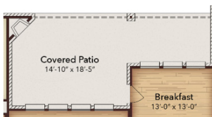
Opt. Outdoor Fireplace