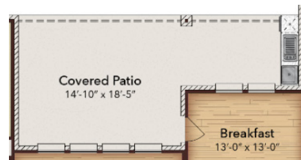
Opt. Outdoor Kitchen