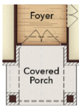
Opt. Double Front Doors