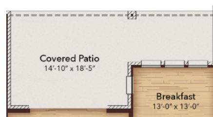
Opt. Sliding Glass Doors