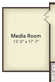
Opt. Media Room