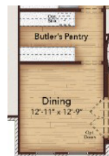
Opt. Dining Room w/ Butler's Pantry