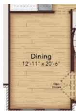
Opt. Dining Room