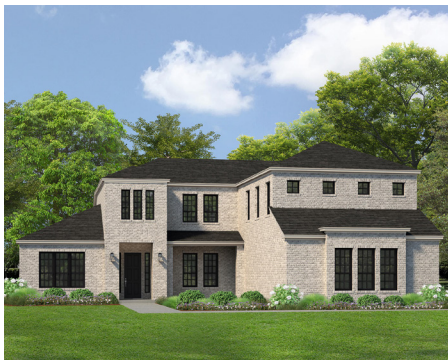
ELEVATION C W/ 3-CAR GARAGE