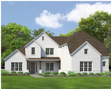
ELEVATION B W/ 3-CAR GARAGE