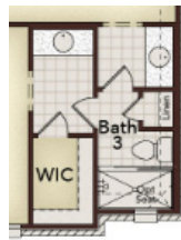
Opt. Walk-In Shower @ Bath 3