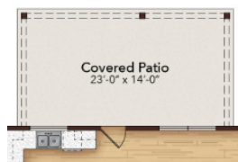
Extended Covered Patio