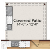
Opt. Outdoor Kitchen