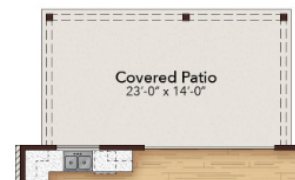
Extended Covered Patio with Sliding Glass Door