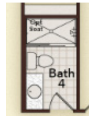
Opt. Walk-In Shower @ Bath 4