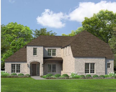
ELEVATION A W/ 3-CAR GARAGE