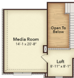
Opt. Media Room