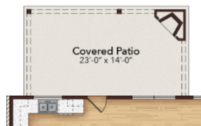
Extended Covered Patio with Fireplace