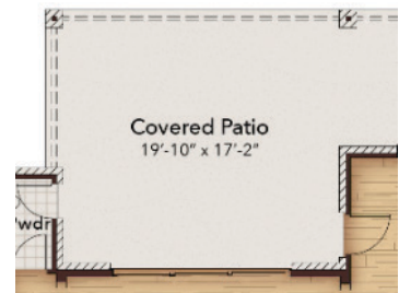
Opt. Sliding Glass Door