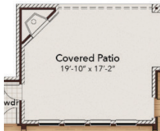
Opt. Outdoor Fireplace