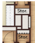
Opt. Electric Fireplace