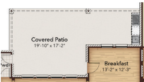
Opt. Outdoor Grilling Station