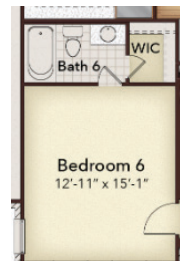
Opt. Bed 6 / Bath 6