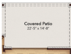
Opt. Sliding Glass Door