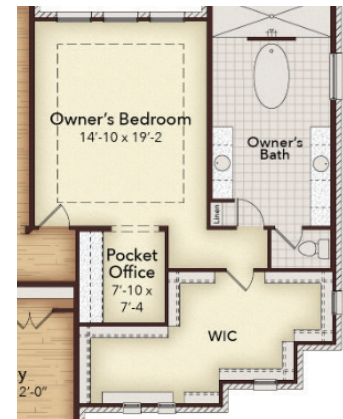
Opt. Pocket Office