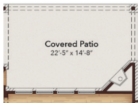
Opt. Outdoor Fireplace