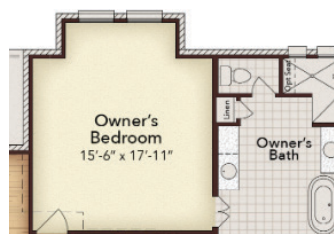
Opt. Bay Window @ Owner's Bedroom