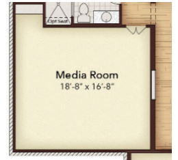
Opt. Linear Fireplace