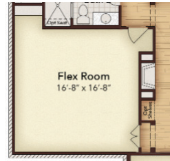
Opt. Flex Room with Fireplace