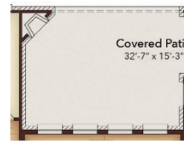
Opt. Outdoor Fireplace