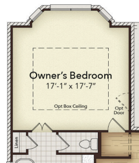
Opt. Bay Window @ Owner's Bedroom