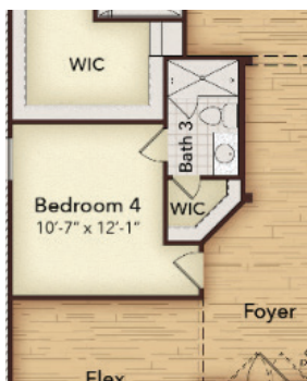
Opt. Walk-In Shower @ Bath 3