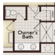
Opt. Owner's Bath