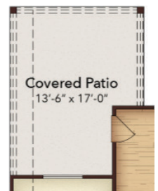
Opt. Extended Covered Patio