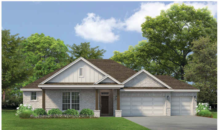
ELEVATION C STONE

*These renderings are an artist's interpretation, actual colors and selections may vary. Some elements shown in renderings display optional upgrades.