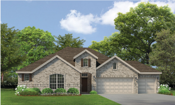
ELEVATION B 3-CAR