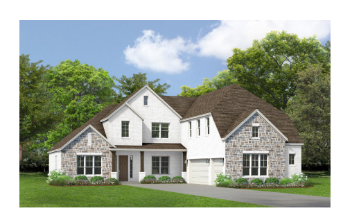
ELEVATION B STONE 3-CAR