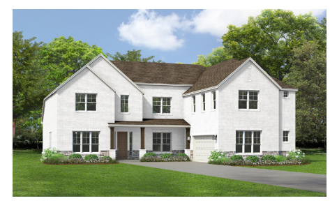
ELEVATION B MEDIA STONE