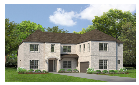
ELEVATION A MEDIA STONE