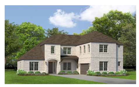
ELEVATION A STONE