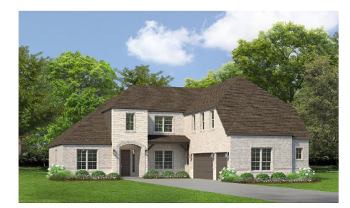
ELEVATION A STONE 3-CAR