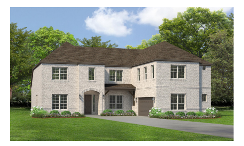
ELEVATION A MEDIA