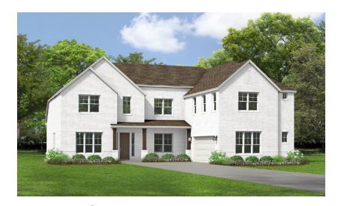
ELEVATION B MEDIA