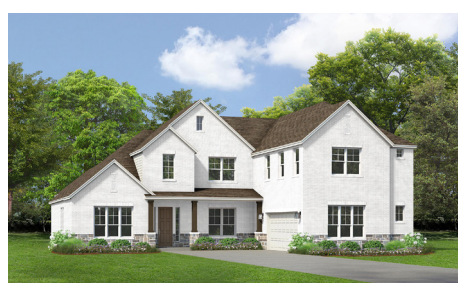
ELEVATION B STONE