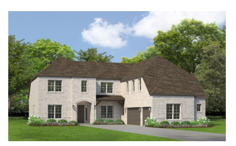
ELEVATION A MEDIA & 3-CAR