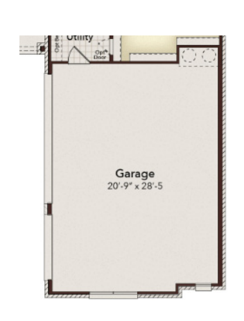
Opt. 3rd Car Garage