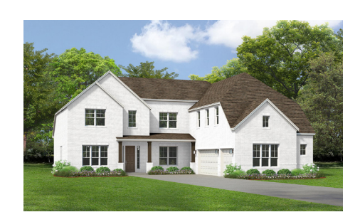
ELEVATION B MEDIA & 3-CAR

*These renderings are an artist's interpretation, actual colors and selections may vary. Some elements shown in renderings display optional upgrades.