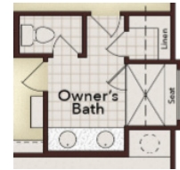
Opt. Owner's Bath