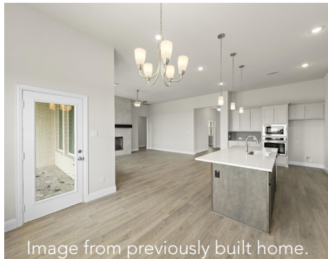
Image from previously built home.