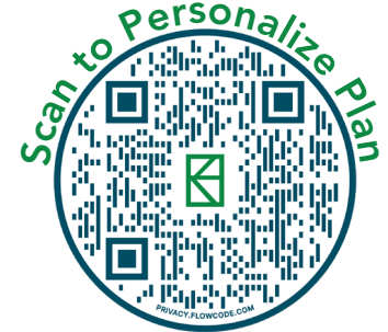
Interactive Floor Plan & Exteriors