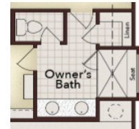
Opt. Owner's Bath