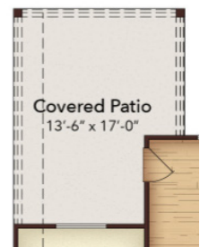
Opt. Extended Covered Patio