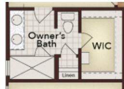
Opt. Alternate Owner's Bath