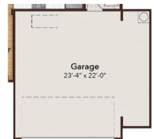
Opt. Garage Extension