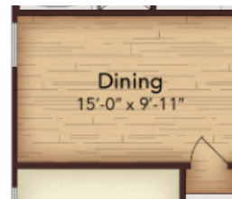
Opt. Dining Room