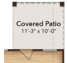
Opt. Extended Covered Patio