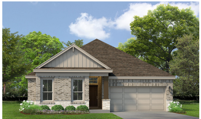
ELEVATION C STONE

*These renderings are an artist's interpretation, actual colors and selections may vary. Some elements shown in renderings display optional upgrades.