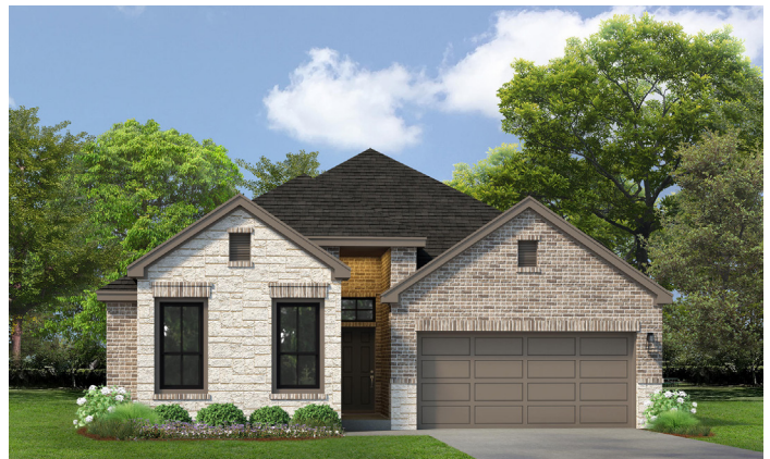
ELEVATION B STONE