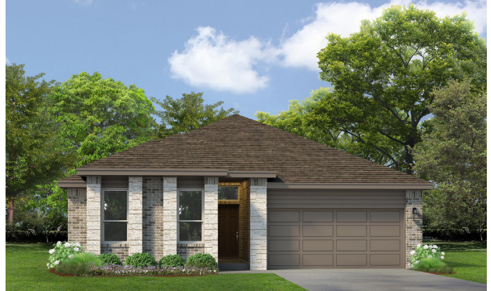
ELEVATION A STONE