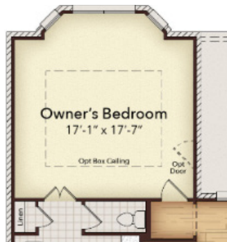
Opt. Bay Window @ Owner's Bedroom