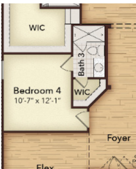
Opt. Walk-In Shower @ Bath 3