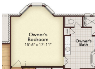
Opt. Bay Window @ Owner's Bedroom