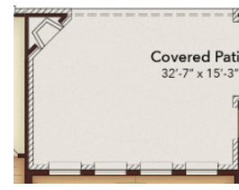
Opt. Outdoor Fireplace