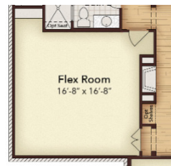
Opt. Flex Room with Fireplace