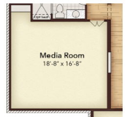
Opt. Linear Fireplace