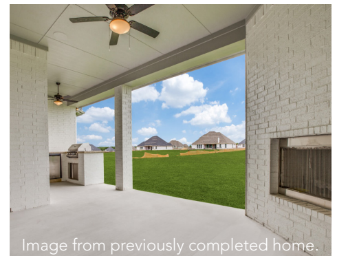
Image from previously completed home.