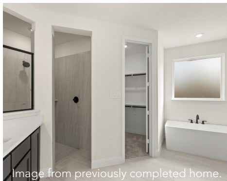
Image from previously completed home.