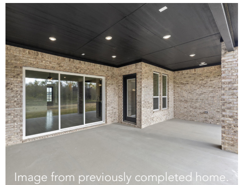
Image from previously completed home.