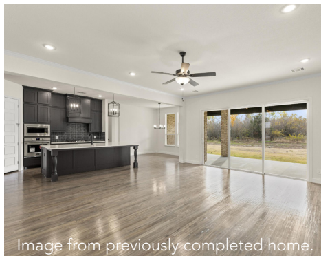
Image from previously completed home.