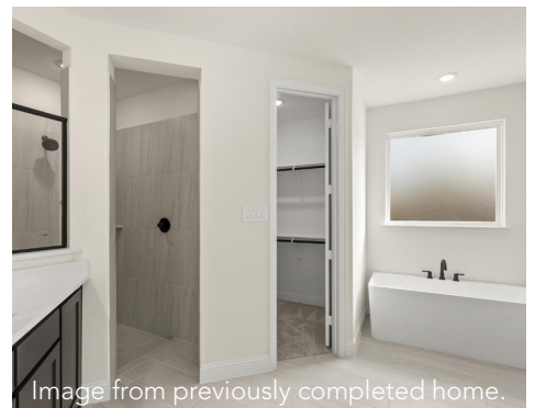
Image from previously completed home.