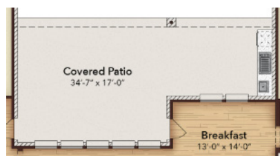
Opt. Outdoor Kitchen