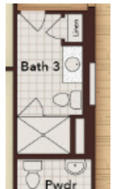
Opt. Linear Fireplace