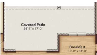
Opt. Sliding Glass Door