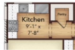
Opt. Spice Kitchen