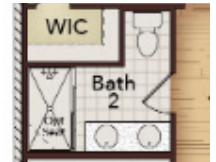
Opt. Walk-In Shower @ Bath 2