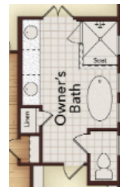
Opt. Shower Seat in Owner's Bath