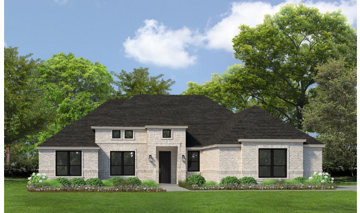
ELEVATION A STONE