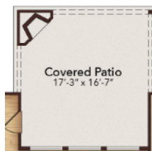
Opt. Covered Patio Extension 3 with Fireplace