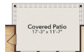
Opt. Covered Patio Extension