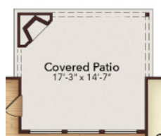
Opt. Covered Patio Extension 2 with Fireplace