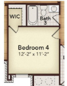
Opt. Bedroom 4 & Bath 3