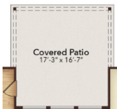
Opt. Covered Patio Extension 3