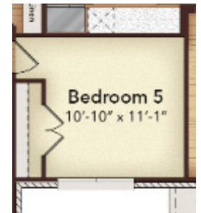
Opt. Bedroom 5