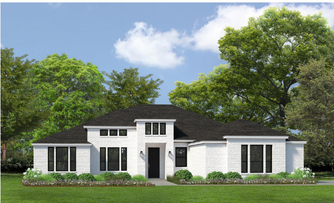
ELEVATION C STONE