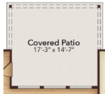
Opt. Covered Patio Extension 2