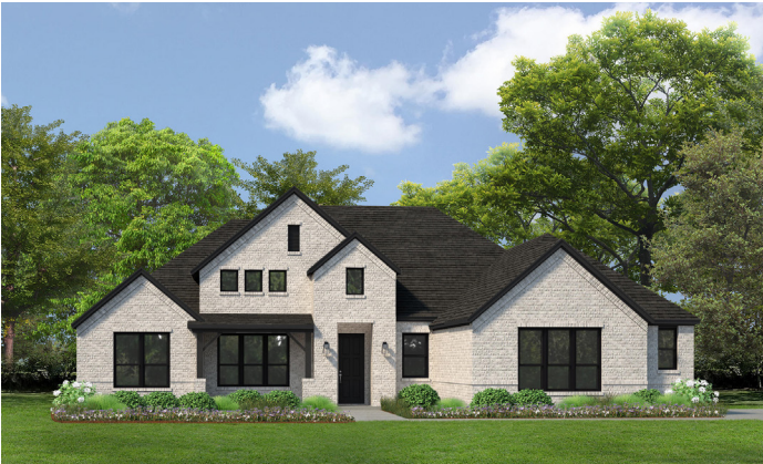
ELEVATION B 3-CAR GARAGE