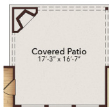
Opt. Covered Patio Extension 3 with Fireplace