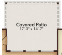
Opt. Covered Patio Extension 2