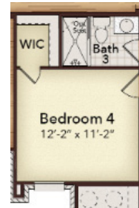
Opt. Bedroom 4 & Walk-In Shower @ Bath 3