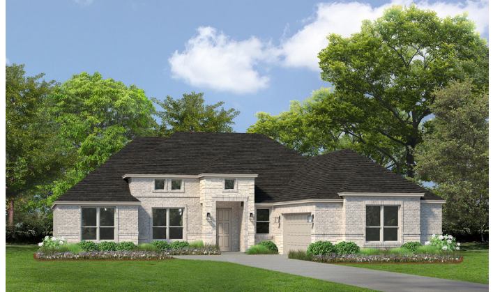
ELEVATION A STONE