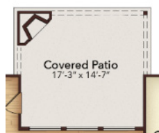
Opt. Covered Patio Extension 2 with Fireplace