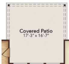
Opt. Covered Patio Extension 3