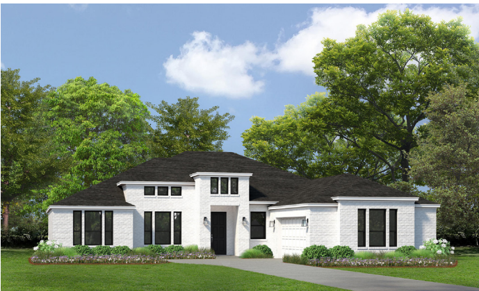
ELEVATION C STONE