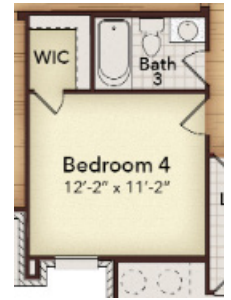
Opt. Bedroom 4 & Bath 3