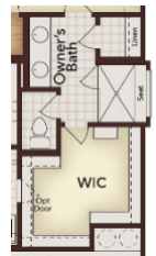
Opt. Alternate Owner's Bath