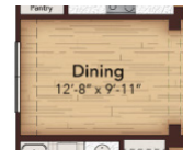
Opt. Dining ILO Study