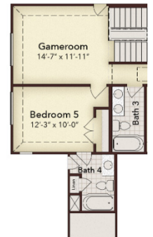
Opt. Bed 5 / Bath 4