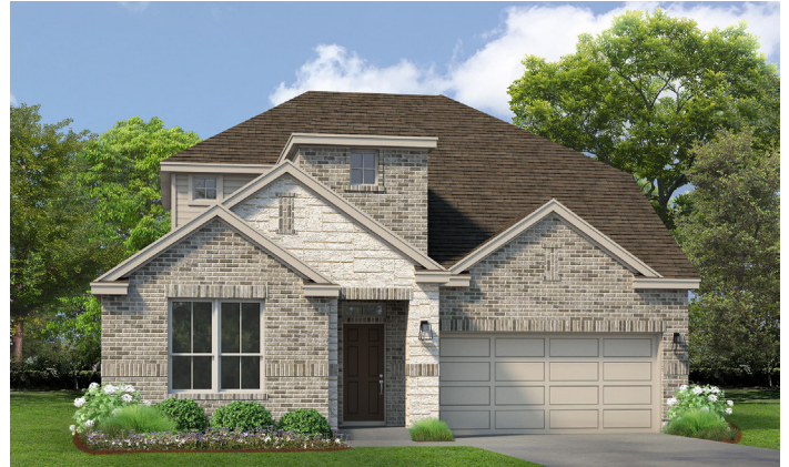
ELEVATION A STONE