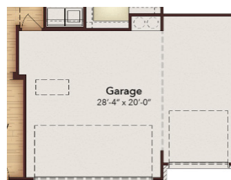
Opt. 3-Car Garage