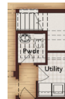
Opt. Powder Bath @ Downstairs