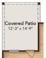
Opt. Extended Covered Patio