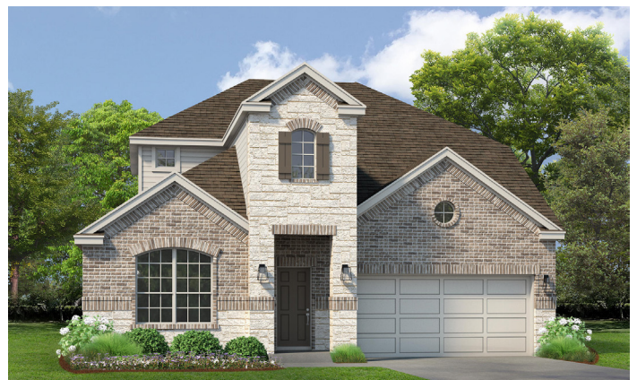
ELEVATION B STONE