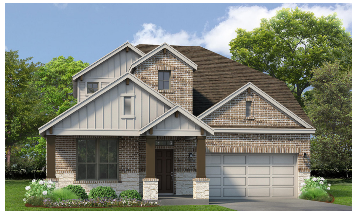
ELEVATION C STONE

*These renderings are an artist's interpretation, actual colors and selections may vary. Some elements shown in renderings display optional upgrades.