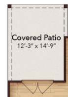
Opt. Sliding Door w/ Extended Covered Patio