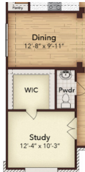
Opt. Study when adding Dining