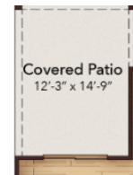
Opt. Sliding Door w/ Extended Covered Patio