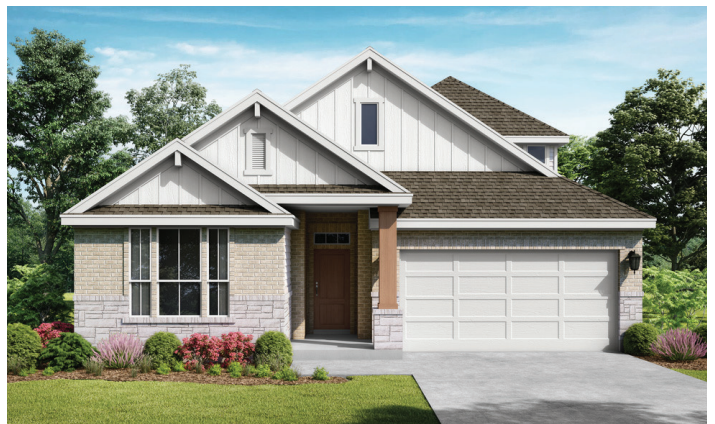
ELEVATION C - STONE

*These renderings are an artist's interpretation, actual colors and selections may vary. Some elements shown in renderings display optional upgrades.