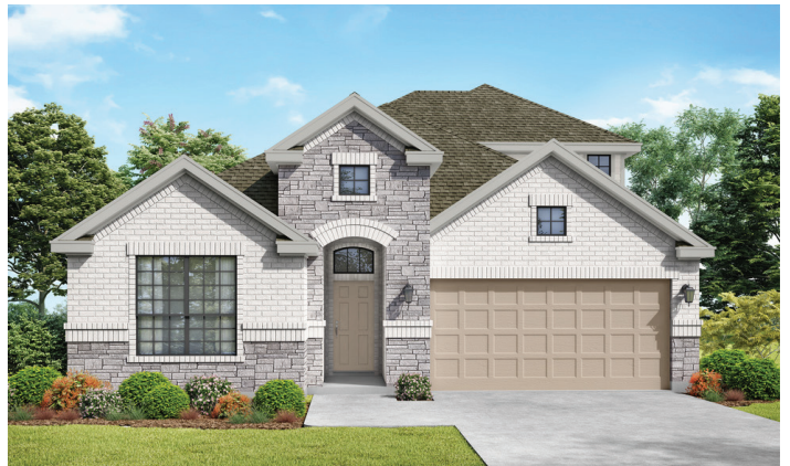
ELEVATION B - STONE