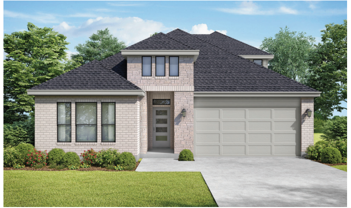
ELEVATION A - STONE